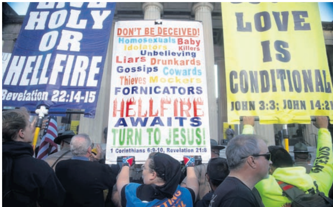
Attendees congregate at a rally against gender-affirming care at War Memorial Plaza in Nashville, Tenn., Oct. 21, 2022.